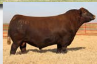
DUFF RED BLOOD 18114 | REG:4091208 AI SIRE TO LOTS 1-23