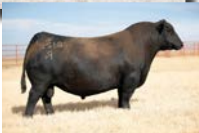
DUFF FEARLESS 20123 | REG:4421611 FULL BROTHER TO SIRE OF LOTS 9,10,11

DUFF-JC 4REAL 16250 DUFF 4REAL 16250 20121 4467813 PELTON MISS AJA 0839U HEREAFTER OPPORTUNITY 415B HEREAFTER JOLENE 627D 3562988 KCC JOLENE A67