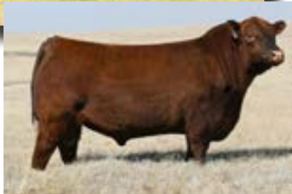
MANN RED BOX 55C | REG:3525359 SIRE TO LOTS 4 & 7

SLGN WIDELOAD 920W MANN RED BOX 55C 3525359 PELTON MISS AJA 0839U HXC CONQUEST 4405P BROWN MS CONQUEST A7067 1607205 BROWN MS ABIGRACE L7730